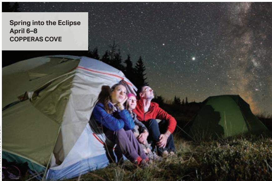
Spring into the Eclipse April 6–8 COPPERAS COVE

Goldthwaite Theatre , 1206 Fisher St. For information on upcoming events, call (325) 451-1811 or visit goldthwaitetheatre.org .